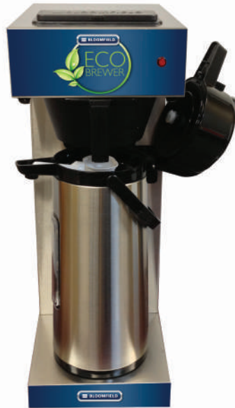
Model 4744-A (thermal servers sold separately)