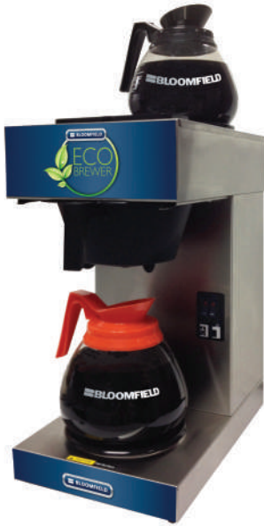
Model 4543-D2 (decanters sold separately)